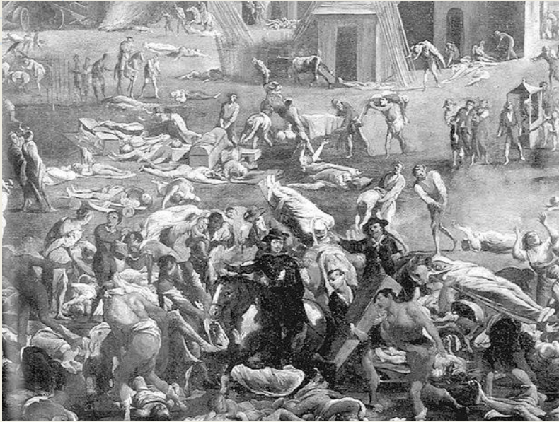
Black Plague, circa 1350s